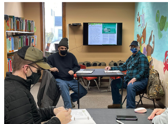
Mid-Michigan Industries (MMI) honored MSU Extension with their Community Partner of the Year Award.