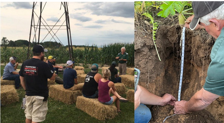
2021 Beginning Grazing School

MSU Extension serves the agriculture industry by engaging in research, education and outreach that enhances the quality of life of Michigan residents. In 2021, Clare County residents had the opportunity to participate in programming related to animal agriculture, agribusiness management, beekeeping, consumer and ornamental horticulture, and field crops, fruit crops, and vegetables.